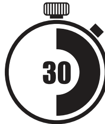
INITIAL APPLICATION (Without Applying Firm Pressure)

NOTE: EZ-Stick Pro Mounting Tabs will damage the wall surface when removed and may not adhere well to some vinyl wallpapers. Caution should be used when mounting ceiling objects. Surfaces that are incompatible with the adhesive, improper cleaning or long-term environmental stresses may cause the bond to fail, for which Auralex is not liable. If the tabs get colder than 50° F (10° C), allow the EZ-Stick Pro Mounting Tabs to acclimate to their mounting environment for 48 hours before installation. Adhesive could soften and lose adhesion above 105° F (40° C).