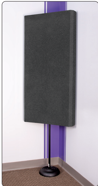
Studio6 shown on stand