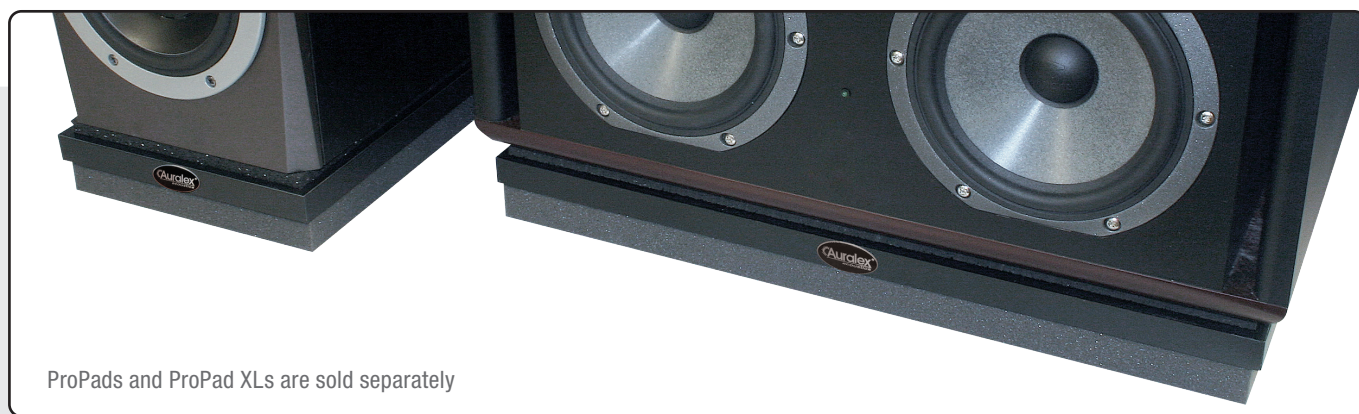
ProPads and ProPad XLs are sold separately

The new design features a ¾" Melamine-wrapped MDF base covered with a thick layer of ISO-Plate™ , the same isolation material as our HoverDeck™ ISO-Pucks™ , which are made from 100% recycled rubber.