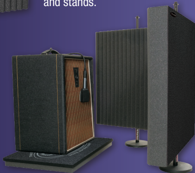
DeskMAX™ shown here with an amp on a GRAMMA®