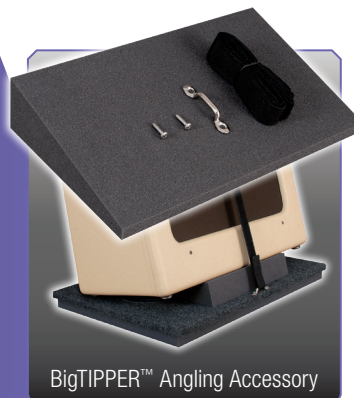
BigTIPPER™ Angling Accessory