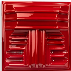
Sports Car Red