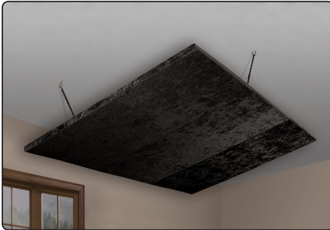
Shown in SonoLite™ Black Velour

Auralex's SonoLite panels are fabric-wrapped Studiofoam® acoustical absorption panels that provide excellent broadband frequency control. Includes easy to install mounting hardware.