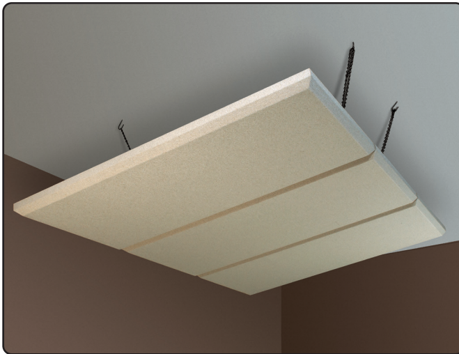
Shown in Sandstone Fabric

For any professional recording studio, the Auralex ProPanel ProCloud is the most effective among all fiberglass mixing clouds with a simple frameless and modular design.