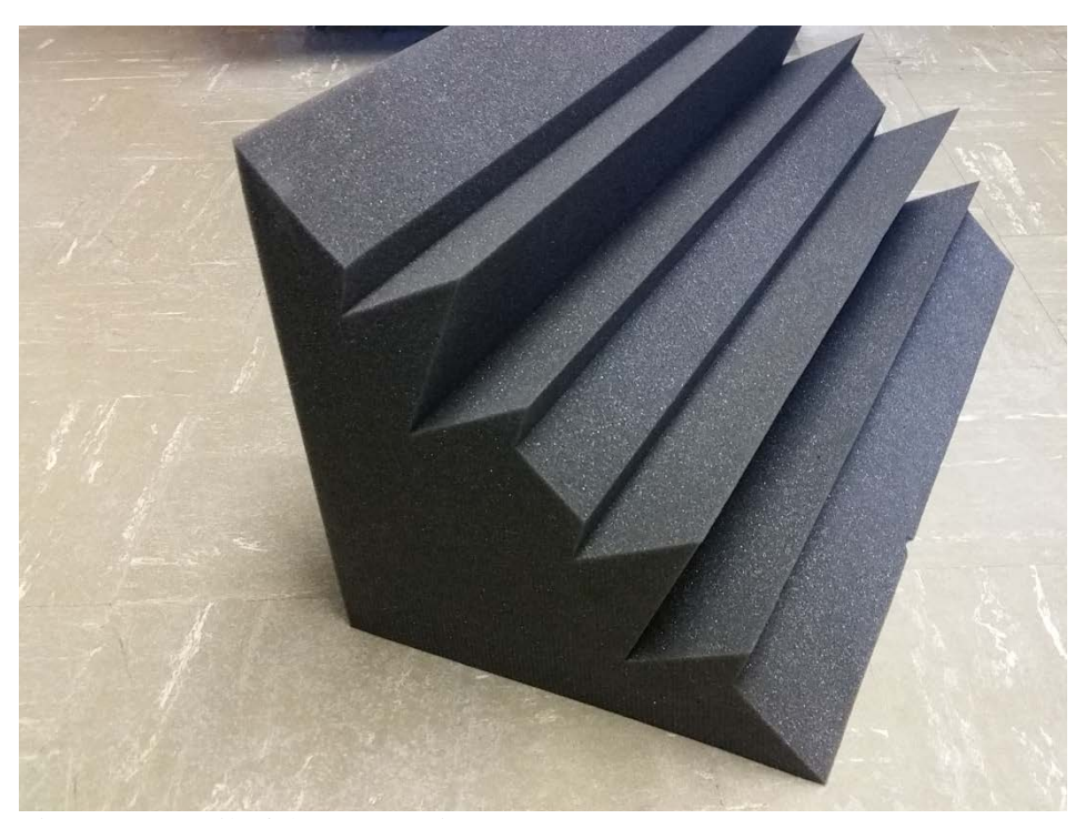
Figure 2 - Detail of the test specimen.