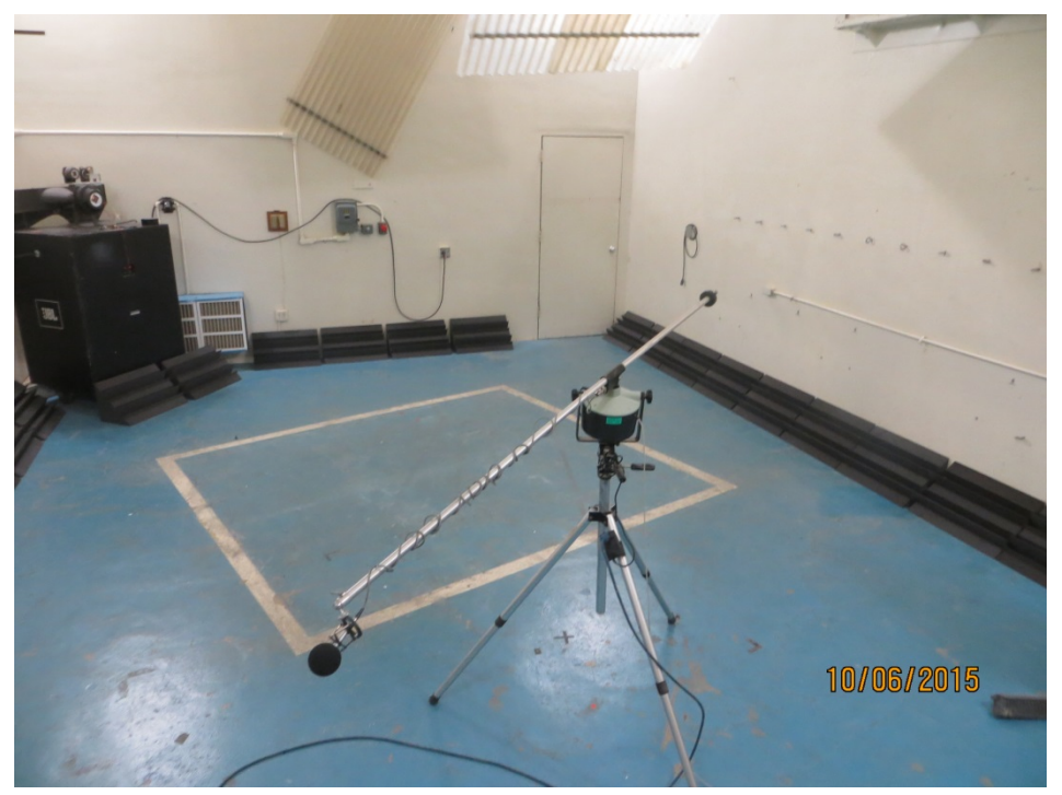
Figure 1 - Specimen mounted in the test chamber.