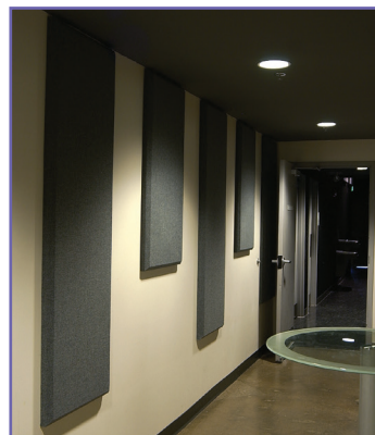
Figure 4: Auralex ProPanels backstage

The final challenge presented by the staff of the Music Mill was the acoustic control of the backstage area. With reflective surfaces on all sides, the echo and resonance of the space from both speech and music created an unacceptable environment for performers, guests and personnel.