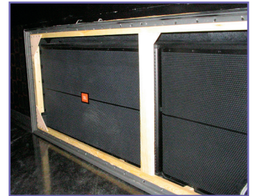
Figure 3: Framed subwoofer enclosure without the fabric installed

Auralex certified installers were contracted to implement the framing, Retention Channel and fabric covering from Guilford of Maine.