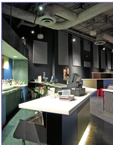
Figure 2: Modified panel layout on sidewall

Through close work with the project's designers, facility managers and contracting dealer, Auralex Engineers were able to create an overall panel design that fit perfectly into the modern environment of the Music Mill and allowed the full performance of the installed audio system to be realized.